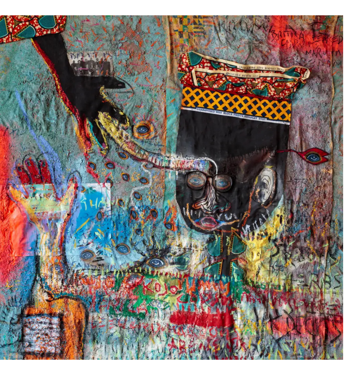
CAPTAIN CUDJOE Mixed media on canvas 39" x 39"