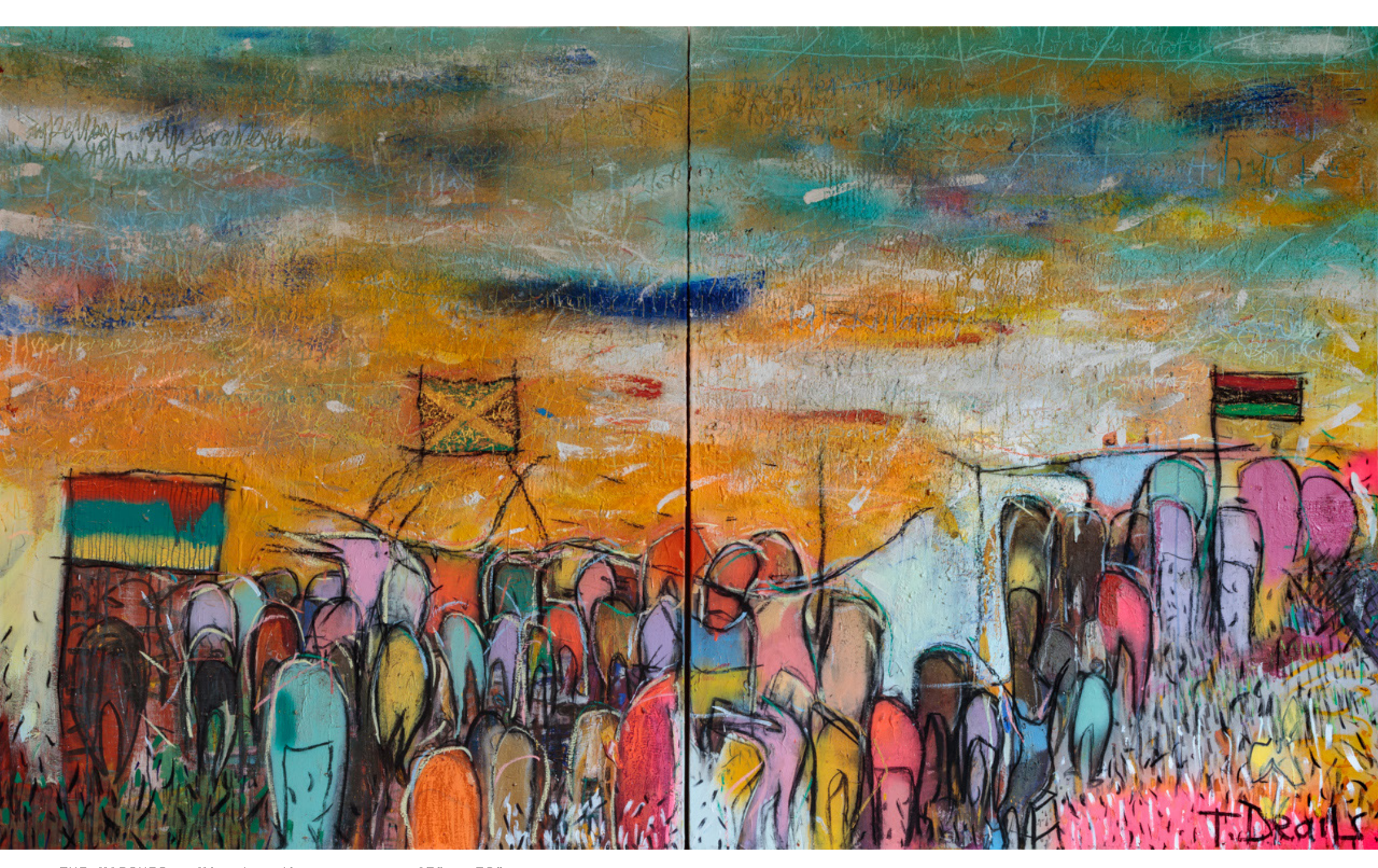
THE MARCHES - Mixed media on canvas 47" x 79"